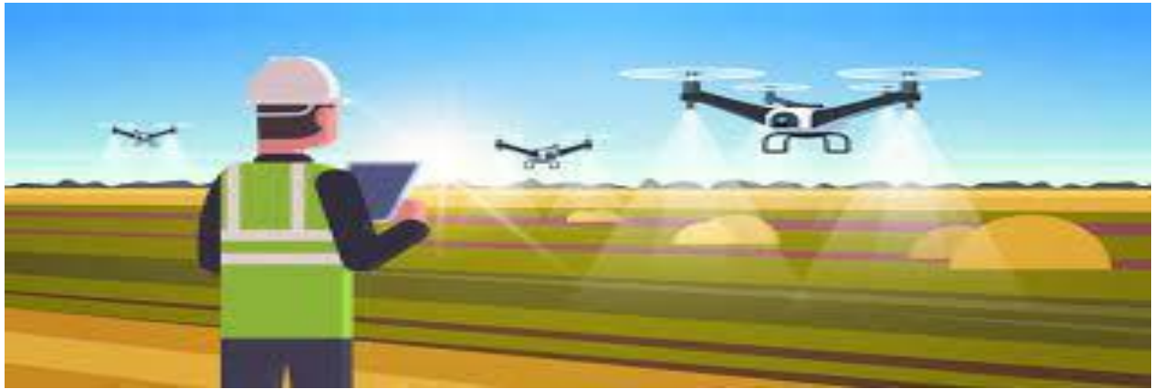
Fig.9 working animation