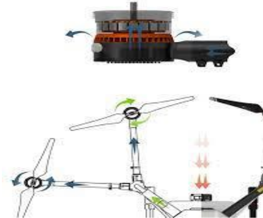
Fig.2.Motor and propeller