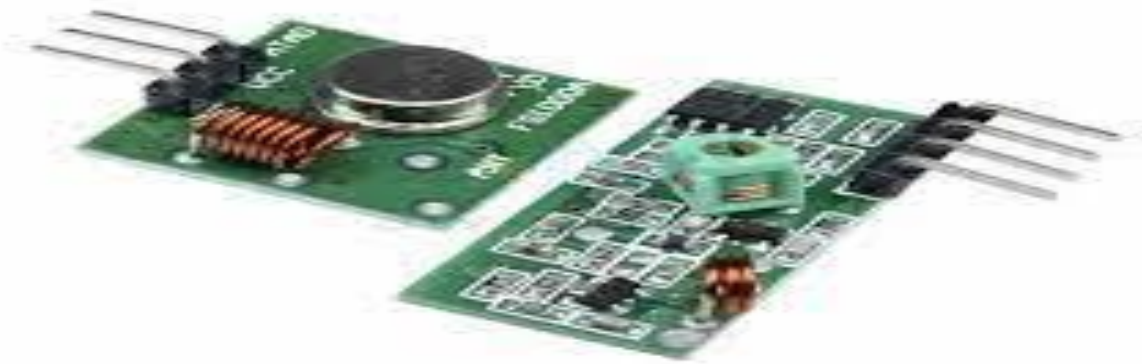
Fig.4. Transmitter and receiver