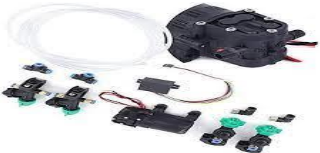
Fig 5. Pump and nozzle

To pressurize the liquid a 12 V DC water pump can be used which has 2.5 L/min capacity can be used. Then the pressurized liquid enters the nozzle and gets sprayed. The nozzle that can be used is a flat fan type for spraying the liquid. Four nozzles are connected with ducts and they are placed at 45cm distance between each other.