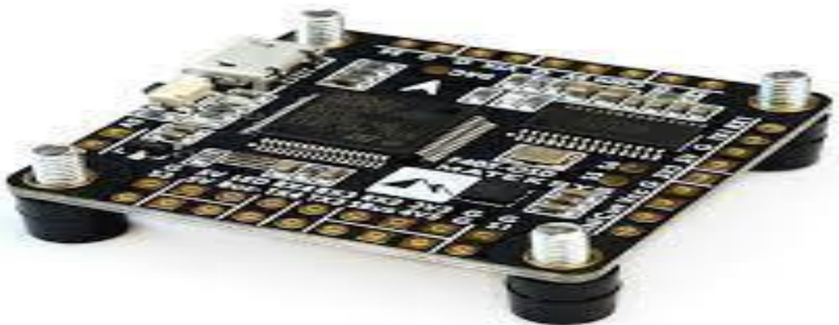
Fig3 . Flight controller

The flight controller helps in the maneuvering operations and also it provides Auto level function. The accelerometer and gyroscope sensors in the Flight controller processes the signals from the receiver and gives the output to the ESC. The KK 2.1.5 Flight controller board can be used in the drone as it has inbuilt firmware. The features of this Flight controller board are much easier for calibration. It uses ATMEL Mega 644PA 8-bit AVR RISC-based microcontroller with 64K of memory.