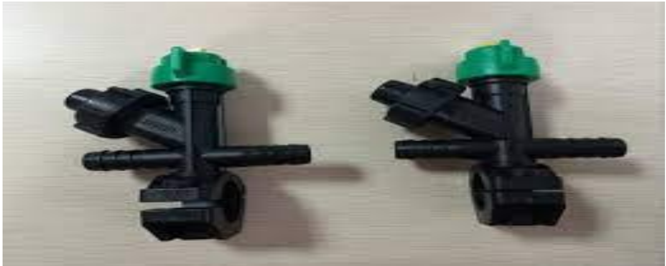
Fig.6 flat fan nozzle