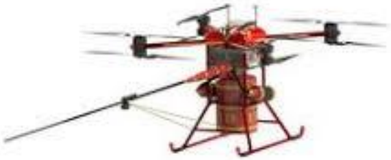
Fig.8 structural description

There is no such generic frame which is considered to be best among all the frames, however it depends on a number of factors like multi-rotor configuration, rotating moment and balancing, application, material, stiffness and components integration. Depending on size and dimensions of selected electronic components, we designed a base plate in the shape of irregular octagon such that all components placed on the Centre of Gravity.